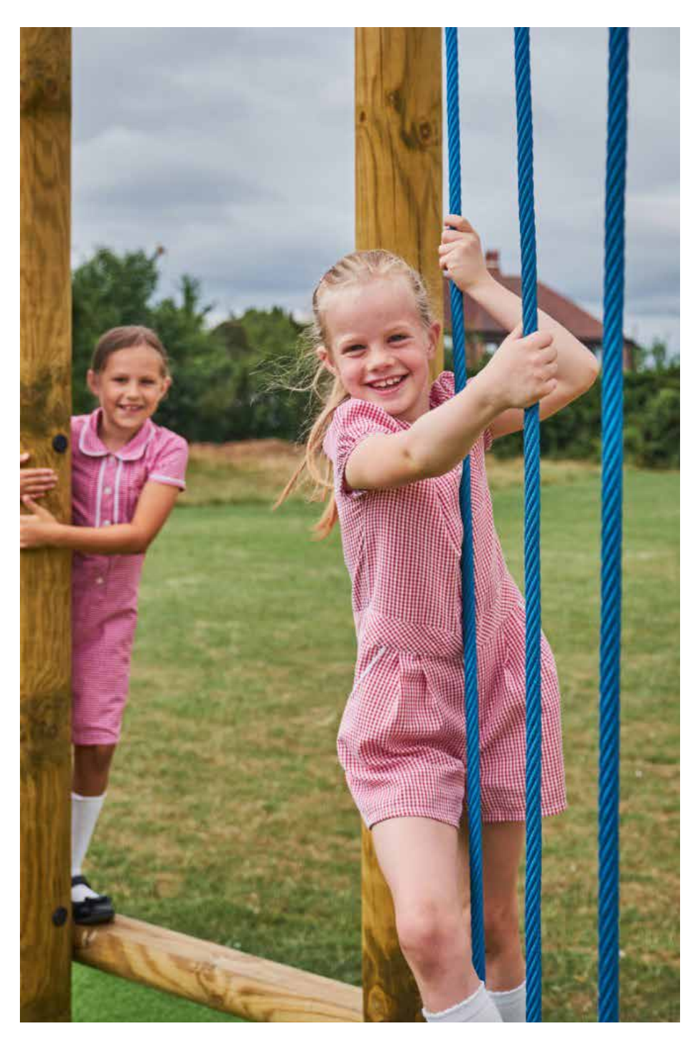
Queensgate Primary School Prospectus < 13